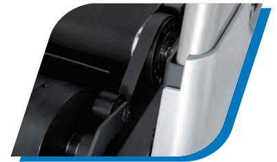
12 Groove Poly-V Belt

The CT900ENT Treadmill combines the workhorse quality and construction of the CT900 with the beauty and innovation of the entertainment display for TV, web browsing and music streaming. With a 15.6" touchscreen display, this console features intuitive function and design to make it quick and easy to get on and go. Robust construction and premium-grade components give users a smooth workout experience, while giving owners the peace-of-mind to know their equipment will live up to the rigors of consistent use.