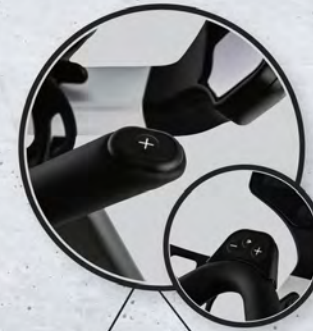
Multi-point touch sensitive electronic shifting