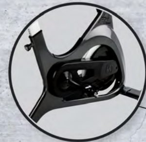
The bike frame is integrally formed