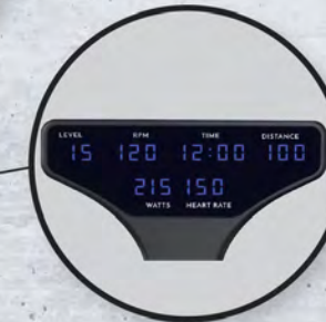
LEVEL, RPM, TIME, DISTANCE, WATTS, HEART RATE