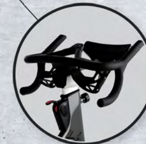
Unique design handlebar