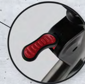
High-security braking system