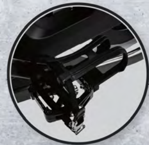
Electronically-controlled magnetic resistance