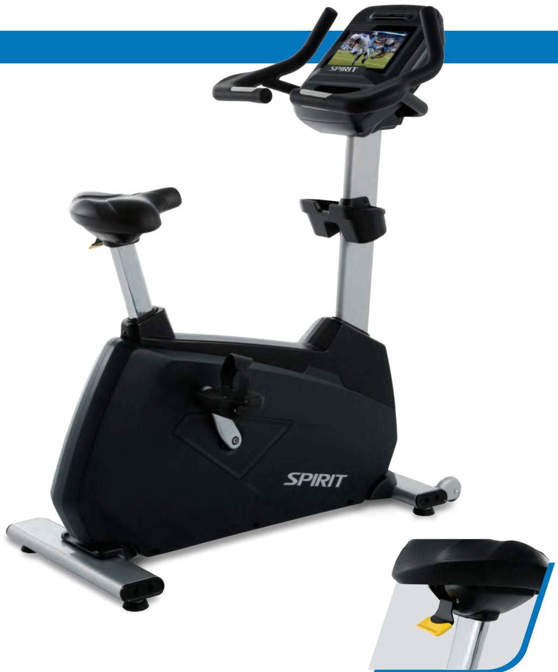
Easy Seat Adjustment

Users get the best of both in motivation and entertainment with the CU900ENT Upright Bike. The 10.1" touchscreen display allows users to watch TV, surf the internet and stream music while they work out. Three workout display modes give users plenty of feedback on their performance and progress. Commercial-grade pedals, cranks and bearings provide outstanding function and durability.